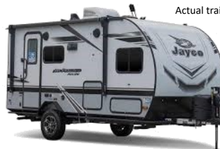
Actual trailer not shown

Hole -In-One Contest for a new Camper Sponsored by Johnston Motors