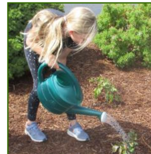
Planting Pansies and Watering Dahlias!